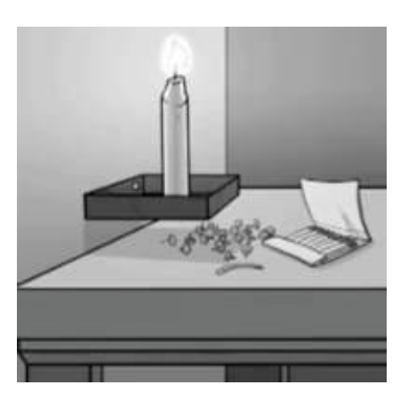
Figure 1. The Candle Problem

named "low-drive" (non- incentivized group), or a reward condition where they could receive $5 for being among the top 25% fastest solvers, or $20 for being the fastest, named the "high-drive" condition (incentivized group).